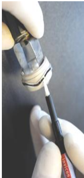
Application Link Latency Min: 1 Minute Latency Max: 1 hour