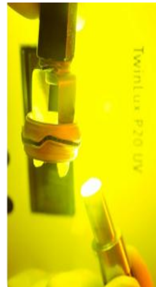
Light curing Curing time 5 sec. Distance 5cm Latency Max: 24hours