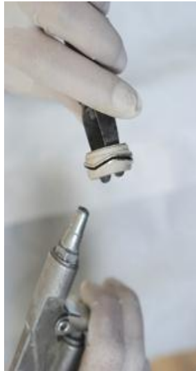
sandblasting AlOx 110my